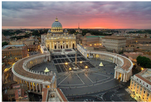
1 - Vatican City