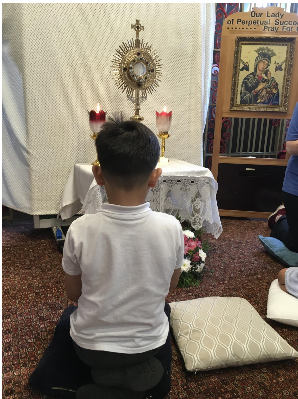
Life at the Rosary Summer 2025